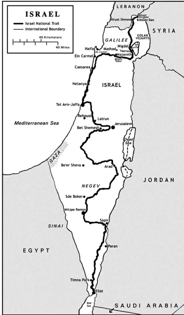
Figure 1. The Israel National Trail.

spatial expression in the country's unique dense network of trails, as well as in the central role hiking plays in the socialisation and education of the Israeli population in general and youth in particular.